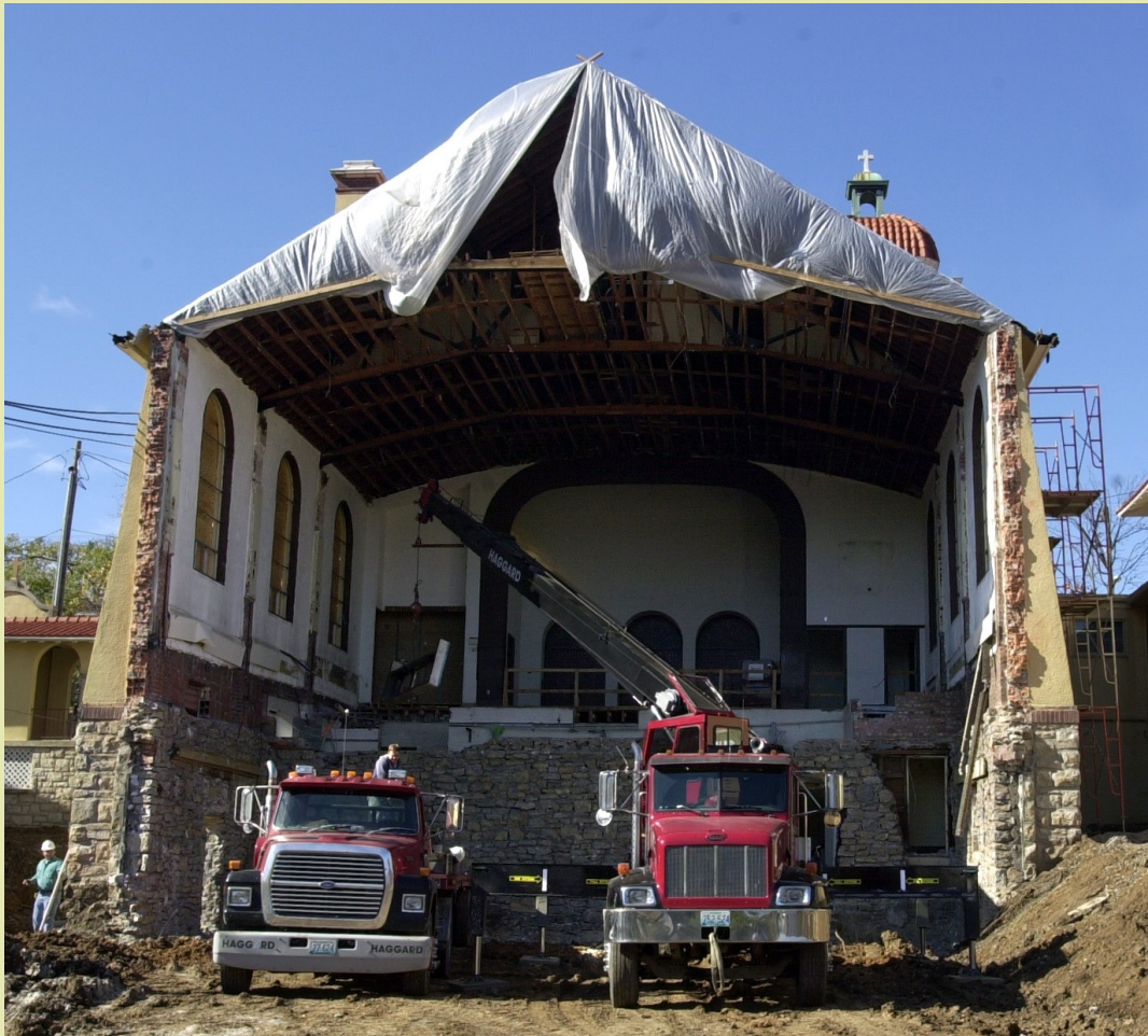
Last month, we celebrated the 20th anniversary of the dedication of Visitation's current church. This photo was taken when the front wall of the old church was removed to accommodate the addition of the new structure. You can see the inside of our present-day narthex at the rear of the photo.